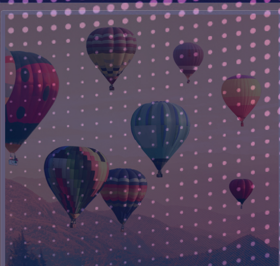
Hot Air Balloons